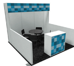
10'x10' Shell Scheme