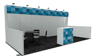
10'x20' Shell Scheme